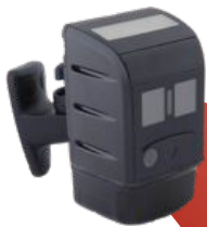
RedEye 20m Telephoto Camera